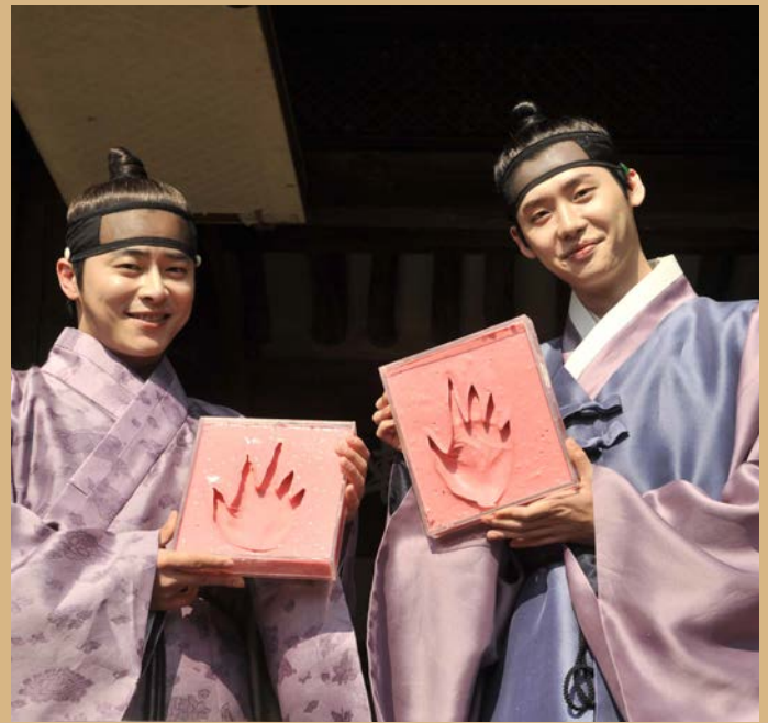
Hand Printing Event at the Historical Drama Festival