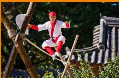
Acrobatics on a Tightrope walking

Your shoulders will be moving up and down and your hands will be clapping before you know it. It is a great opportunity to appreciate Korea's hilarious energy by enjoying traditional performances carried out exactly the way they used to be.