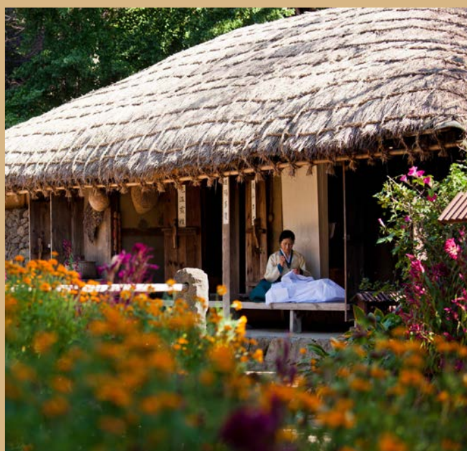
A quaint house of Jeju Island