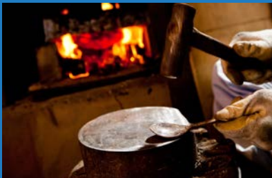
Brass Ware Workshop