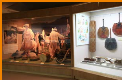
Korean Folk Museum

Take a journey into the past in a Village of the Joseon Period. Diverse exhibits on display will help you feel traditional culture more vividly.