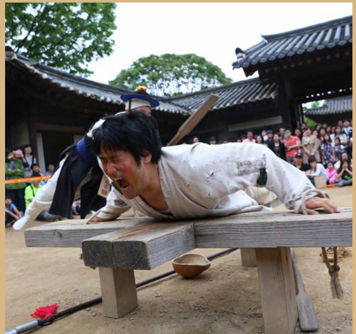
Punishment tools in the government office