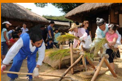
Rice threshing activity