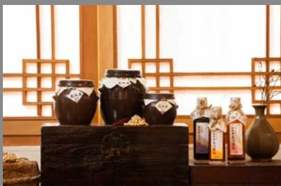
KfV Traditional Foods