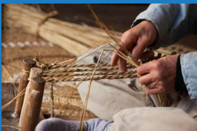
Straw Shoes Workshop