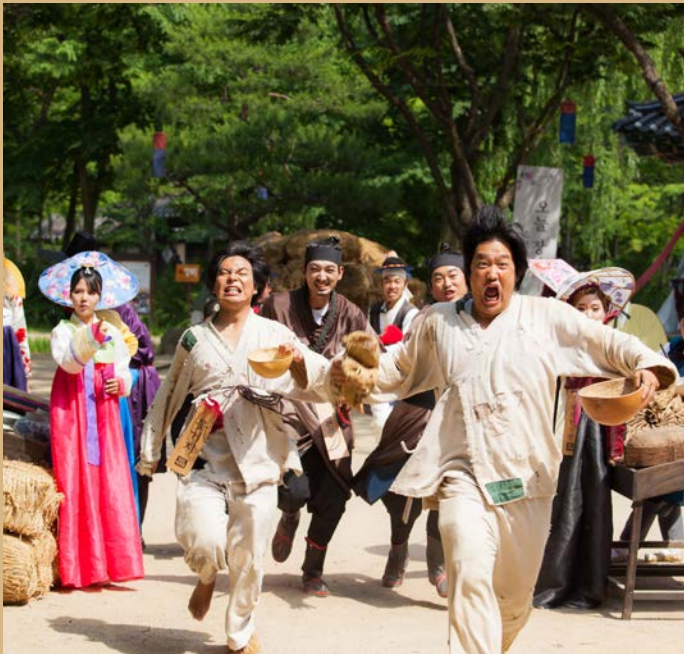
Welcome to Joseon! Joseon Cultural Festival