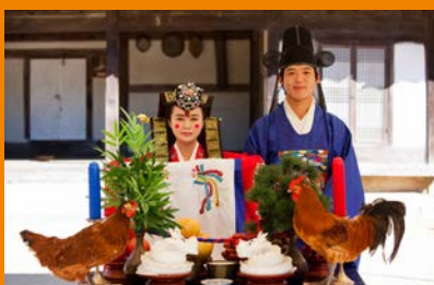
Traditional Wedding Ceremony