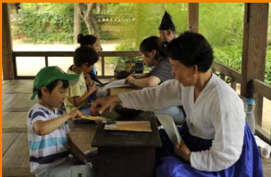
Maternal Grandfather's Home in Summer