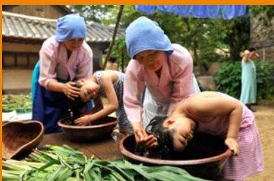
Washing hair in sweet flag-infused water