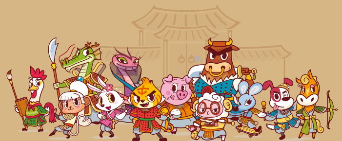
The Twelve-animal-warrior guard of KFY

Foreigners and companies | KFY Promotions Team at 031.288.2883, 1708~9