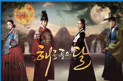
Moon Embracing the Sun (2012)

Even at this moment, an enchanting story is being created in the KJV, the hub of historical film and drama production. While enjoying a variety of events and activities themed on historical dramas, you yourself become a hero or heroine.