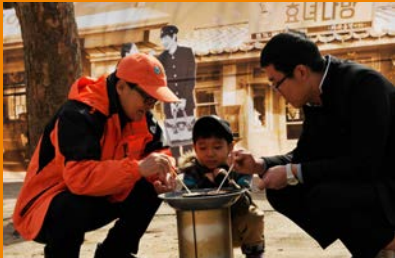
The Play from Those Old Days

The KfV teaches you to play with traditions all year round. Please enjoy the unique pleasure of watching our unique events, traditional folk culture reinterpreted with a modern flavor.