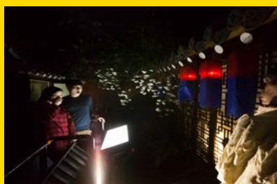
Visitors to the Horror of Ghost Zone

A combination of modernity and tradition has produced an exotic haunted house here. Many attractions, based on local ghost stories, present unique experiences that help visitors learn and play with tradition at the same time.