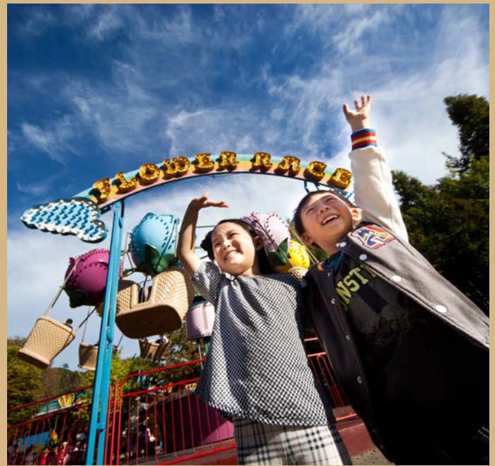
Recreational Village in the KfV