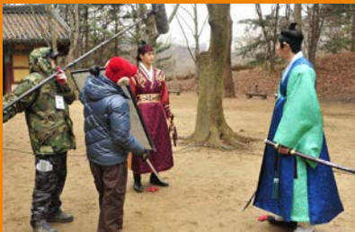
Historical Drama Festival