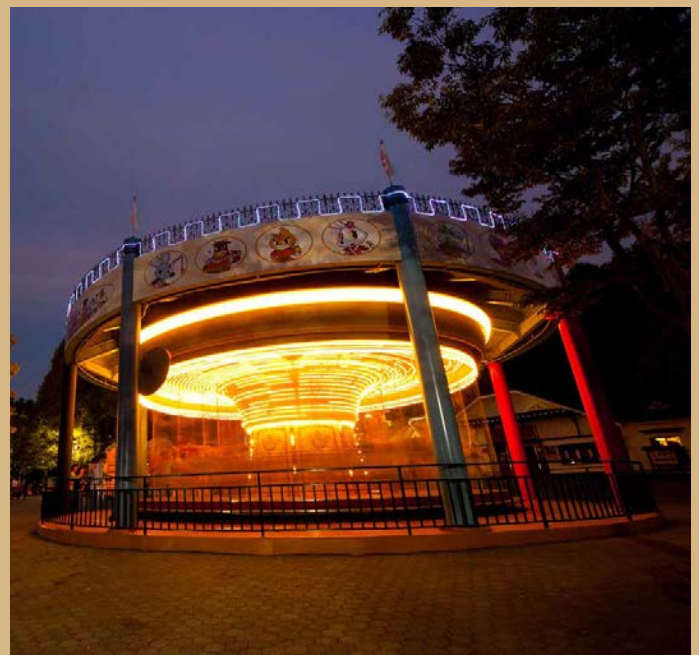
Carousel at the Recreation Village