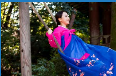
Rope Swing Ride