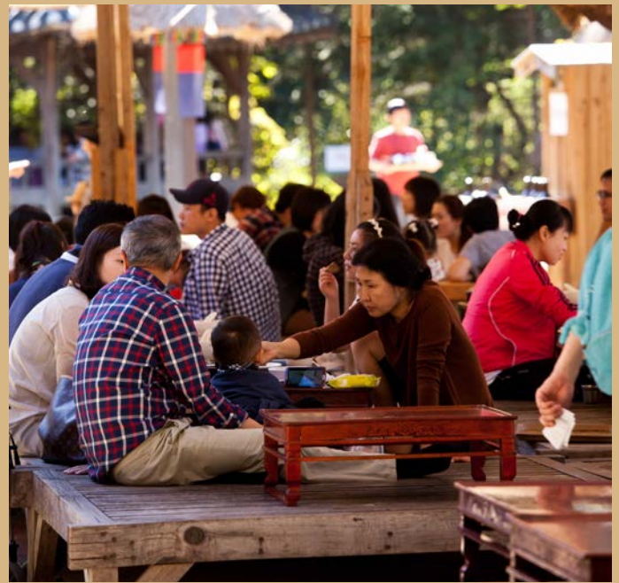
Street Market in the KfV