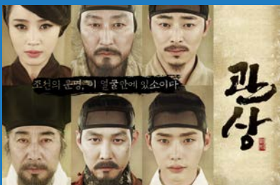
Face Reader (2013)