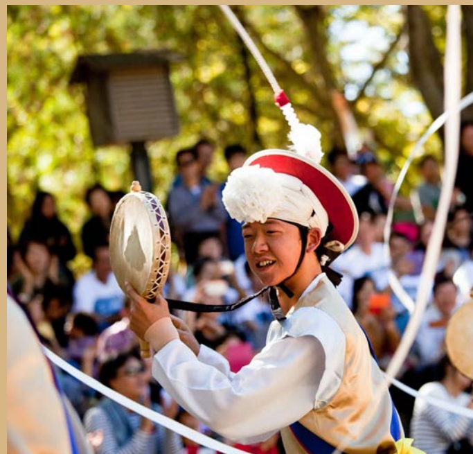
Entertaining Farmers' Music and Dance Performance