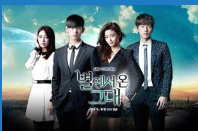
My Love from the Star (2014)