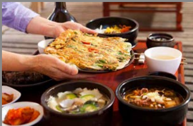
Korean home style food served at the Bazaar