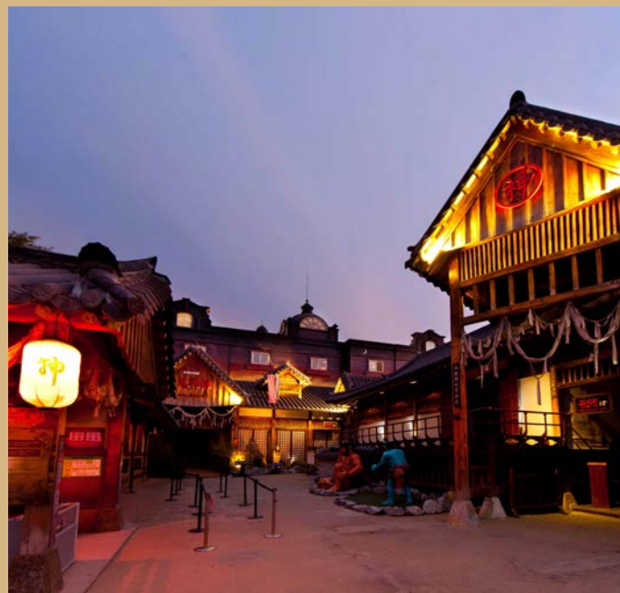
Legendary Hometown, and the Horror of Ghost Zone