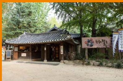
Mask Dance Exhibition Hall