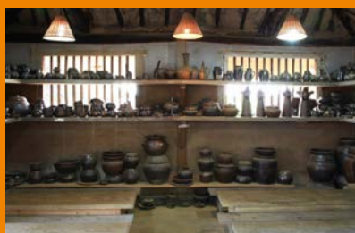
Pottery Exhibition Hall