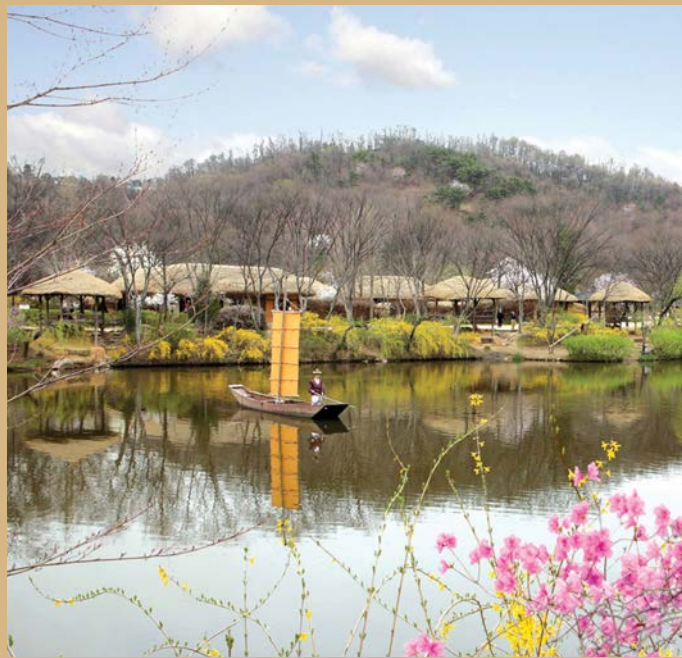
Spring in the Joseon Village