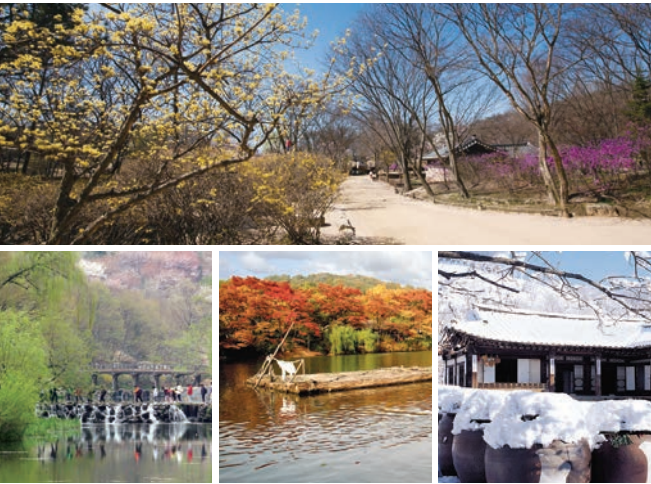
The Korean Folk Village in Spring · Summer · Autumn · Winter

A typical village of the Joseon period has been recreated on a 245-acre site regarded as a propitious location according to the principles of feng shui, with a river flowing in front of it and a mountain behind it. Visitors can experience our Korean ancestors' native wisdom in the Korean Folk Village where 270 traditional Korean houses have been relocated from the various regions of Korea, and can take part in a re-enactment of the ancient way of life.